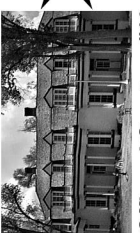
Officers' Quarters #13