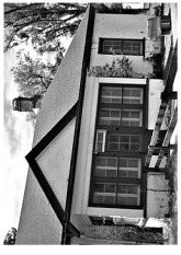
Commanding Officer's Quarters