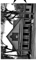
Officers' Quarters #3