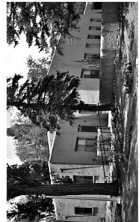
Nurses' Quarters Courtyard